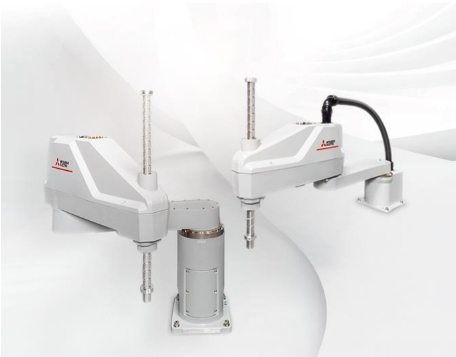
Image: Left: MELFA RH-20CRH, Right: MELFA RH-10CRH. These new robots provide manufacturers with greater flexibility in adopting digital manufacturing while addressing skilled workforce shortages.

Mitsubishi Electric has launched its MELFA RH-10CRH and RH-20CRH SCARA robots, providing manufacturers with greater flexibility in adopting digital manufacturing while addressing skilled workforce shortages. These new robots enhance industrial automation through high-speed operation, easy installation, and exceptional efficiency. Compact and lightweight, they are ideal for manufacturers aiming to boost productivity while navigating space and weight constraints.