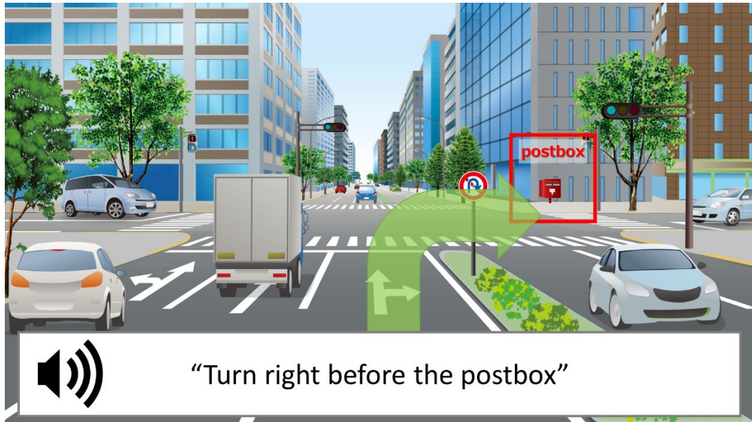
Example of Scene-Aware Interaction providing contextual guidance