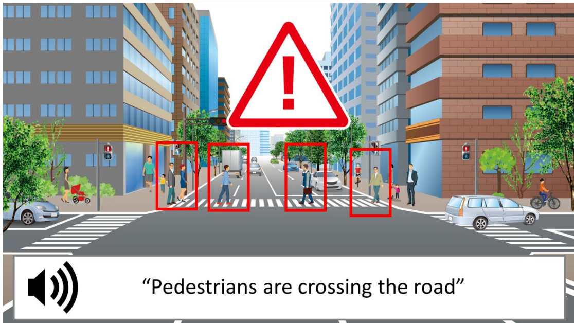
Example of Scene-Aware Interaction providing guidance to avoid hazards