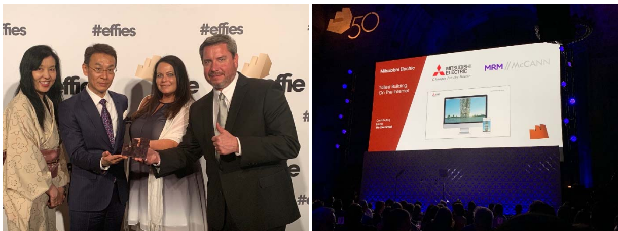
Effie Awards Ceremony ( Local time on 30th May, 2019 : In New York • Effie US GALA)

TOKYO, June 3, 2019 – Mitsubishi Electric Corporation (TOKYO: 6503) announced today that Mitsubishi Electric US, Inc.'s Building Solutions website has received a Bronze award in the business-to-business category (BtoB) of the Effie Awards, an international awards program recognizing excellence in advertising. Mitsubishi Electric is the only winner of BtoB category this year, and this is believed to be the first time that a Japanese electronics manufacturer has captured Effie Awards in this category.