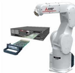
Insertion into MELFA-FR series