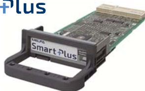
MELFA Smart Plus Card