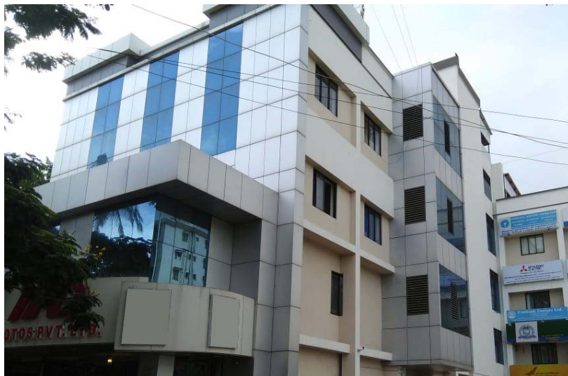
India Coimbatore FA Center office

TOKYO, January 23, 2019 – Mitsubishi Electric Corporation (TOKYO: 6503) announced today that it will establish an "India Coimbatore FA Center" in Coimbatore, in India's Tamil Nadu State. Scheduled to commence operations from February 1, the new facility will further strengthen the service network of the company's factory automation (FA) products in India and facilitate expansion of its FA system business.