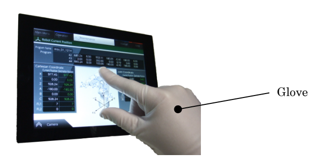
\label{lem:missing} \mbox{Mitsubishi Electric Color TFT-LCD module with projected capacitive touch panel} \\ \mbox{AA070ME11-PCAP} / \mbox{AA070MC11-PCAP}

TOKYO, December 24, 2015 – <u>Mitsubishi Electric Corporation</u> (TOKYO: 6503) announced today the coming launch of two seven-inch WVGA color TFT-LCD modules with projected capacitive touch panels with up to five millimeter-thick cover glass. Sample sales will begin on January 5 through Mitsubishi Electric offices worldwide.