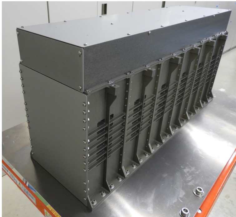
Lithium-ion batteries for the Gateway