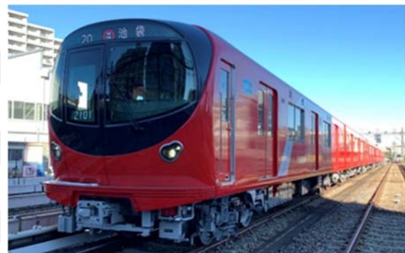
Overview of Mitsubishi Electric’s TIMA