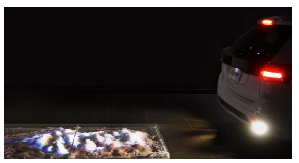
Animated illuminations projected on road surfaces are highly visible even in bad weather