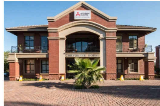
The South Africa FA Center Satellite, established in cooperation with Adroit Technologies

The production of electric machinery is thriving in Italy, and Mitsubishi Electric foresees increasing demand for product support services in the automation sector. Meanwhile, South Africa is seeing rising investment in social infrastructure projects, which is expected to draw an increased number of Japanese manufacturers and drive growth in local industries such as mining.